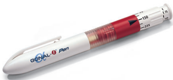
The pre-filled Gonalf® pen system developed for Serono for treating infertility has been available on the market since spring 2004.

Given that no further FreeStyle sales will be booked in the second half, the full-year sales growth forecast for the Ypsomed Group in the 2004/05 business year remains unchanged at 15–25%. We expect a further improvement in net profit. With growth so strong, our capital expenditure will be considerable this year and will reach around CHF 90.0 million.