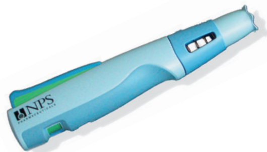
NPS Pharmaceuticals intends to use a new type of pen system from Ypsomed to inject the substance PREOS® for treating osteoporosis.